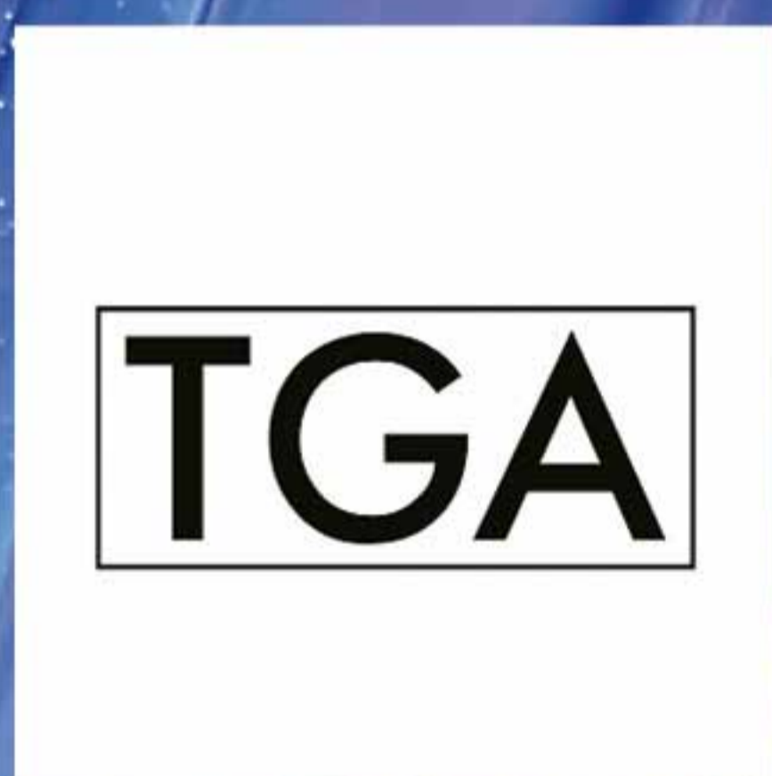
Therapeutic Goods Administration

At Eastern Pharma, we empower industries and enhance health, providing custom-tailored solutions that propel success and uplift health standards in every industry we engage with. Trust us, relax, and experience expert excellence with Eastern Pharma.