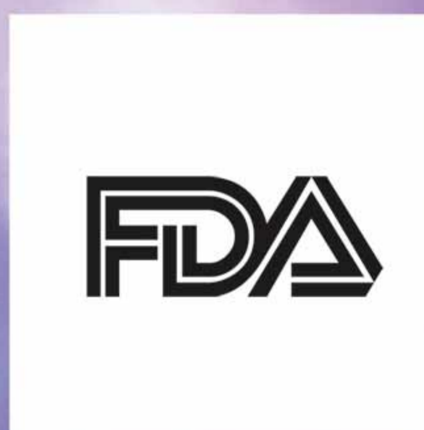
Food and Drug Administration