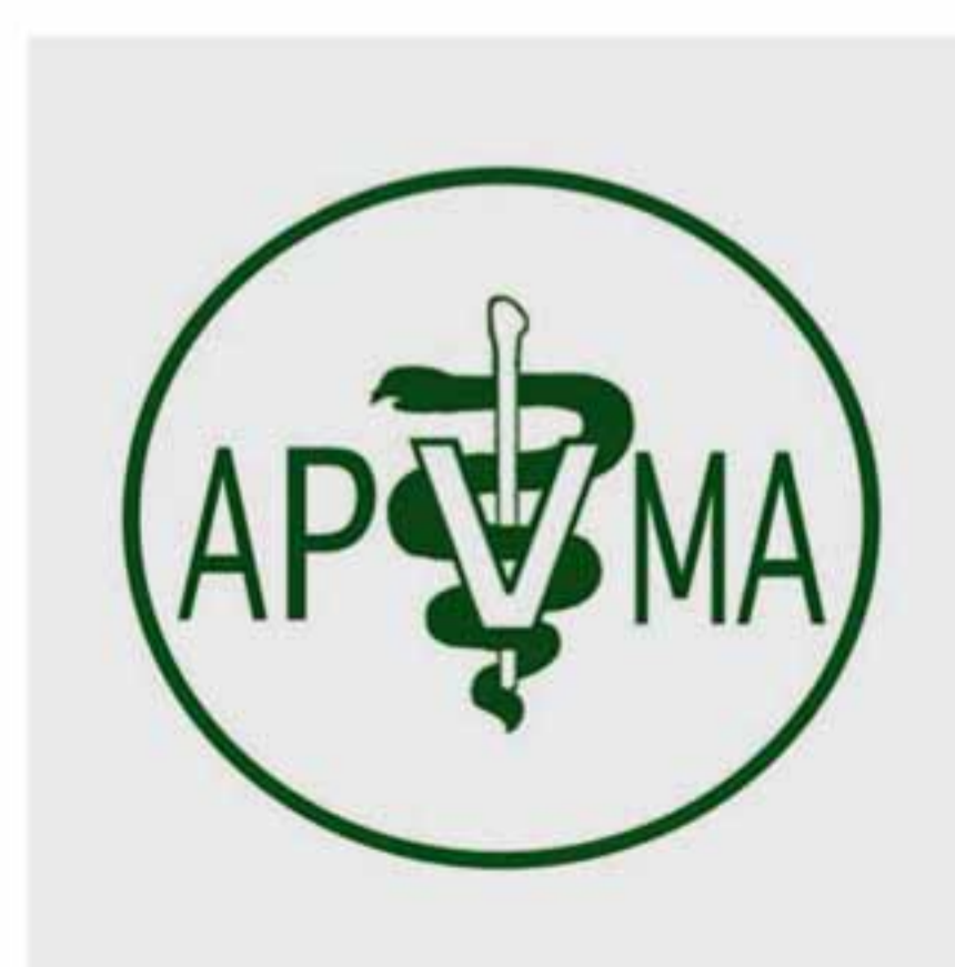
Australian Pesticides and Veterinary Medicines Authority